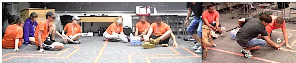
Figure 4. Day 3 racing activity: (Left) Teams at their identical race tracks; (Right) the primary instructor (also blind) demonstrates how to tactually measure the shape of the track.

Day 3 focused on predesigned activities that would encourage more complex coding, which involved three missions on race tracks setup for each group (see fig. 4). The first mission involved making KIBO move by clapping from the start to point A, singing a song one time, moving forward until near point A, and turning right.