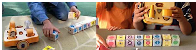
Figure 2. Arranging coding blocks (left); Scanning to program KIBO (right). Images from kinderlabrobotics.com.

Participants (see Table 1) in this study were high school students and pre-collegiate young adults (aged 15 through 19) attending a two-week summer institute on college preparedness for learners with dis/abilities in a rural section of the Northeastern US. The study took place in July 2017 during a three-day making workshop offered as an optional activity. Each session lasted between 1-1.5 hours over the 3-day period. Five of the nine participants completed all informed consent requirements. The nine participants were divided into two groups: A ( N=4 ) and B ( N=5 ). We identified participants' visual acuity based on their survey self-identification as compared to the four World Health Organization classifications (WHO, 2018). All names have been changed to protect confidentiality.